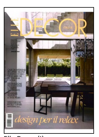
Elle Decor (I)